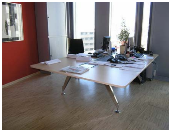
Double workstations in the secretariat with the invitation desk system.

When the real-estate and consulting company moved to its new Frankfurt headquarters, the offices of the oval building in Baseler Strasse were completely renovated. The workstations of the 40 employees, some of which are in individual offices, some of which are in share offices, receive natural light either from the interior courtyard or the outer facade of the building. Intensive wall colours in red and green shades create a warm and powerful atmosphere.