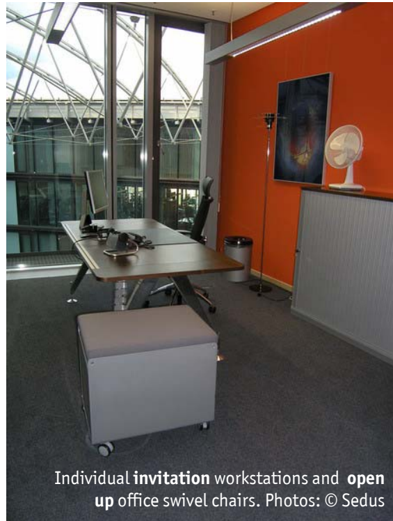
Individual invitation workstations and open up office swivel chairs.

When the real-estate and consulting company moved to its new Frankfurt headquarters, the offices of the oval building in Baseler Strasse were completely renovated. The workstations of the 40 employees, some of which are in individual offices, some of which are in share offices, receive natural light either from the interior courtyard or the outer facade of the building. Intensive wall colours in red and green shades create a warm and powerful atmosphere.