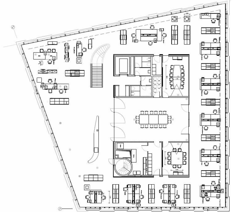
A main staircase made of concrete takes visitors through an attractively curved stair well leading to the first floor. Employees can move between the floors via an internal spiral staircase that connects the open space with the "thinking room", the model-making workshops and the cellar.