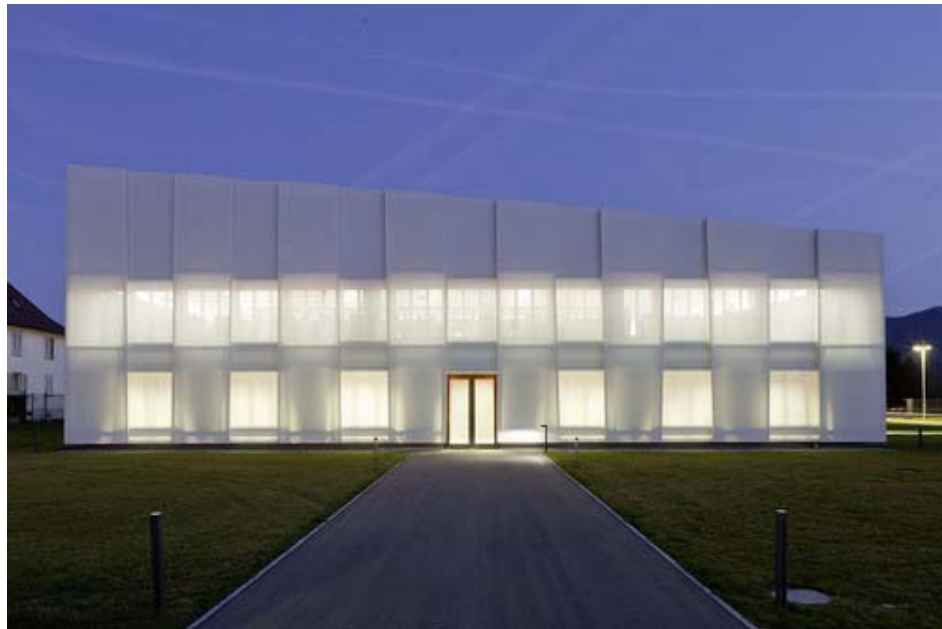
The new development centre is in the direct vicinity of the high-bay warehouse designed by Sauerbruch Hutton. Different light moods are created, depending on the time of day. Sun study below: Ludloff + Ludloff Architekten.