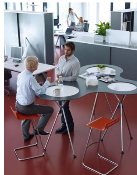
On the top floor, designers, engineers and buyers work in an open space. The large counter and the foyer provide space and opportunity for informal conversations during coffee breaks. On the right, their meet chair bar stool at the counter and a meet table with over easy .