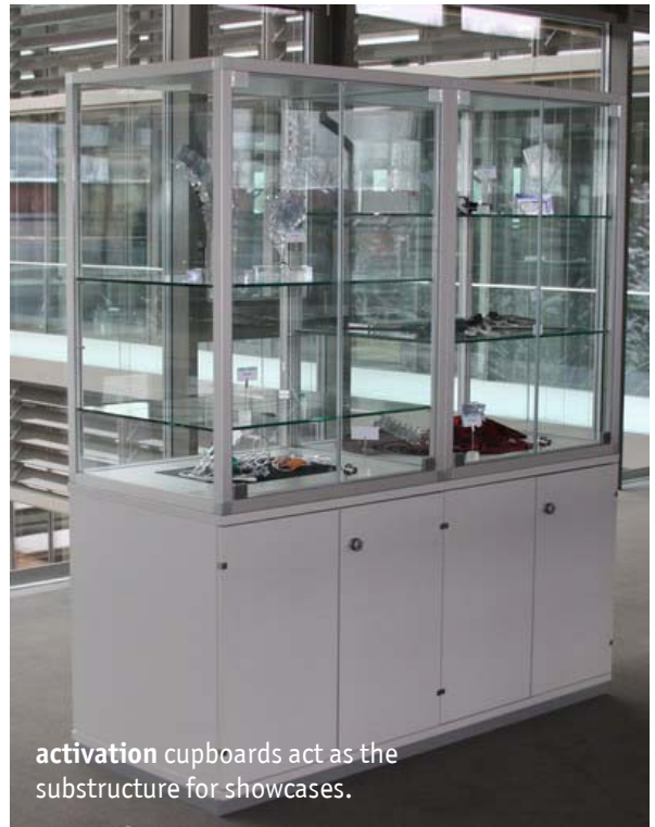
activation cupboards act as the substructure for showcases.

activation fosters spontaneous meetings.