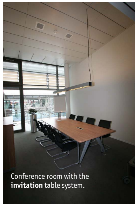
Conference room with the invitation table system.